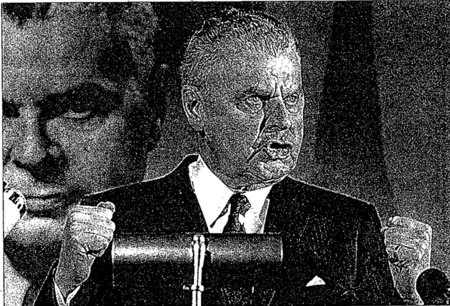
HISTORICAL HIGH: Modern Canadian voter turnout peaked in 1957 and 1958 when the Progressive Conservatives, led by John Diefenbaker, won a surprise victory in the federal election and then were re-elected with a huge majority.

This evidence is dramatic and reflects a growing trend among demo-